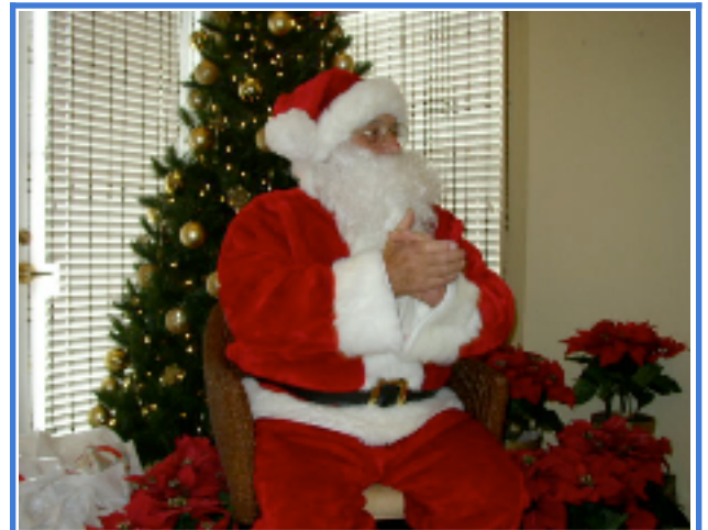
Santa prepares to meet the children.